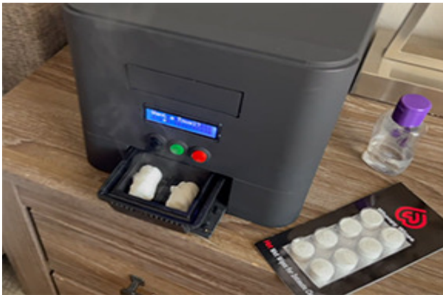
Package of eight in a sterile blister pack cartridge

Similar to Keurig, Whoopy Wipes has 2 components – an electric machine and a consumable. It uses compressed towelettes (cotton wipes) and a dispenser that heats and sprays hot water onto expandible wipes. The dispenser saturates two towelettes at a time (his and hers) and it's steamy hot within 45 seconds. Once delivered, the sterile, biodegradable wipes are unfurled and used to clean up messes.